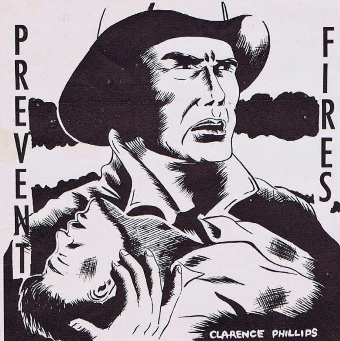
by Diane Walker

What will your children see when they look for forests? Will they see charcoaled trees, devastated wildlife, and darkened skies? They will see this if you, the people of today, do not halt the criminal carelessness that causes forest fires.